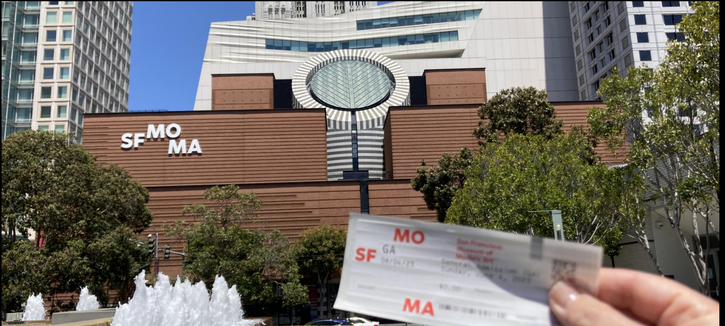
We are visiting the San Francisco Museum of Modern Art. Some people like to call it SFMOMA.