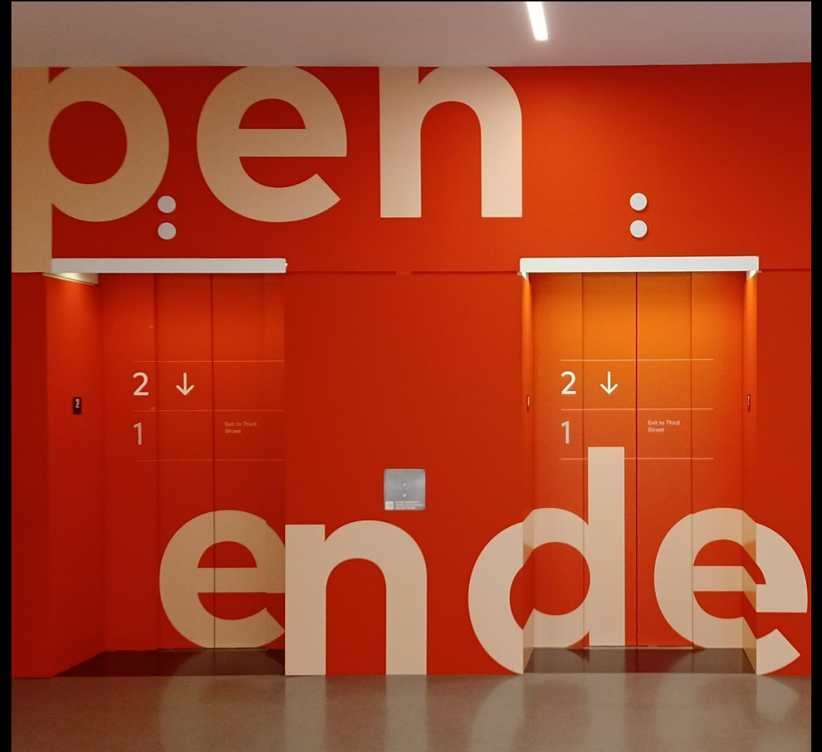
When we're ready to leave, we can take the Silver Elevators down to Floor 2. From here, we can either take the stairs or the Red Elevators to Floor 1.