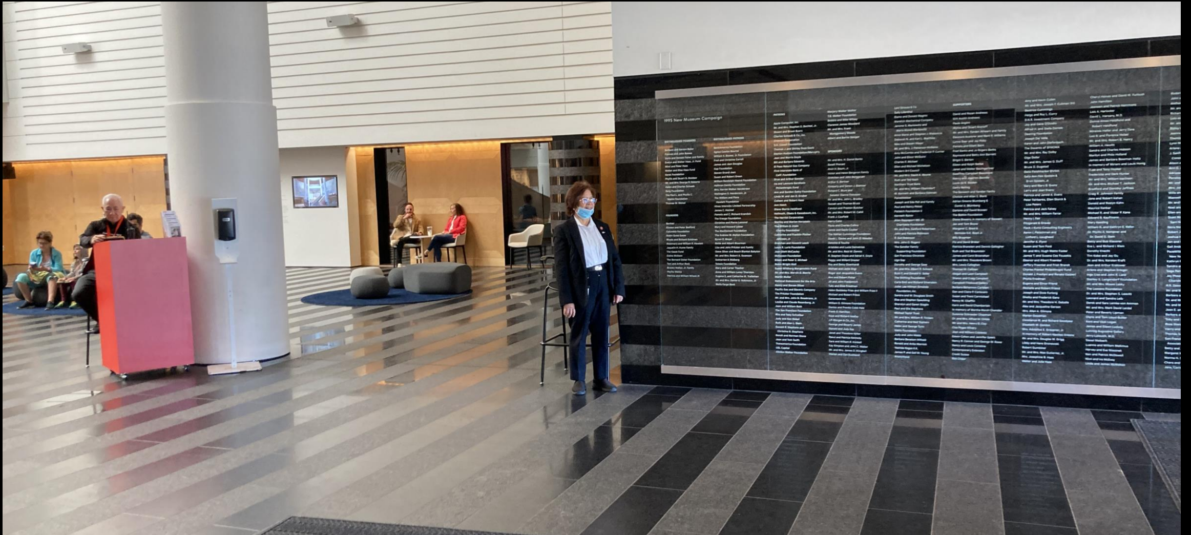
A guard will say hello to us when we enter. They may talk to us about our backpacks, our food or drinks, or help us understand where to go. This is OK.