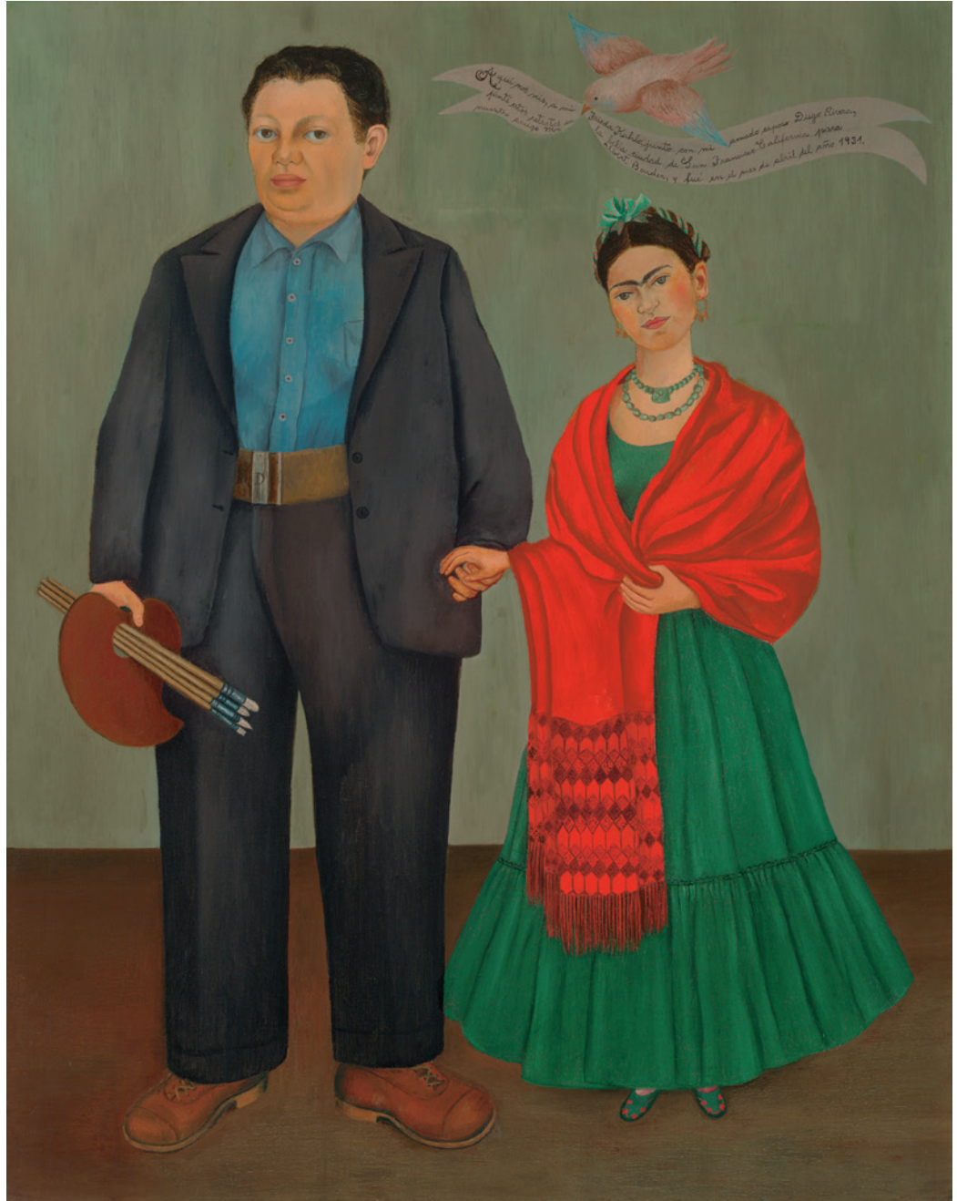
Frida Kahlo, Frieda and Diego Rivera , 1931

was born in Mexico in 1907. She loved to draw when she was a child. When Kahlo was 18, she was in a bus accident and had to stay in bed for months to recover. While she was in bed healing, she made paintings about what she felt and saw, including many self-portraits —paintings of herself. When Kahlo was better, she showed her paintings to the famous Mexican artist Diego Rivera, who encouraged her to become an artist, and who later became her husband.