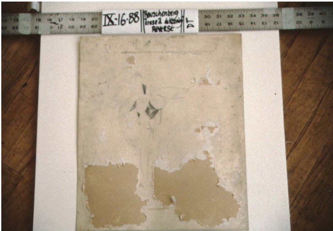
Verso of Erased de Kooning Drawing with mount partially removed

The piece was laid face down on a glassine-covered light box as a visual aid in the removal process. Each layer of the backing board was methodically delaminated and removed using a metal spatula. This delicate, time-consuming treatment was done without the use of moisture.