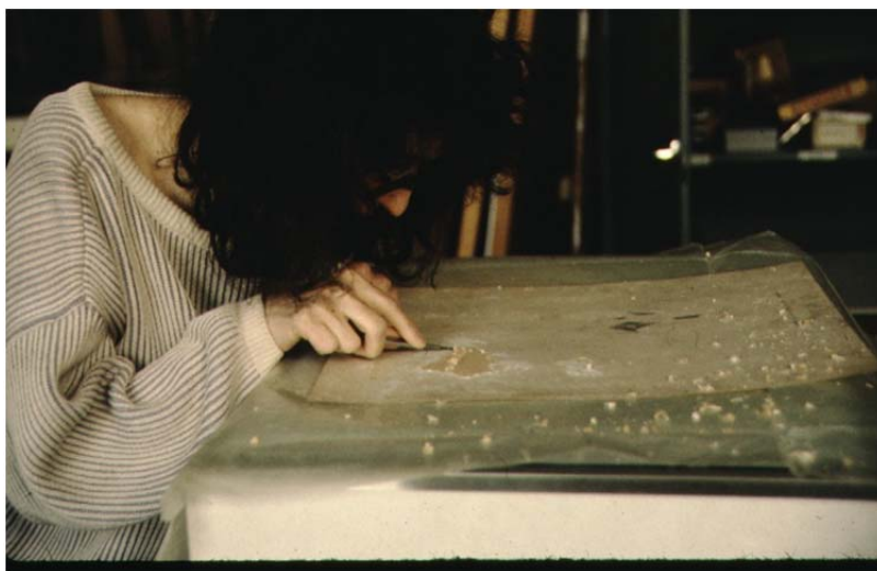
Conservator from Cranmer Art Conservation removing the mount from Erased de Kooning Drawing