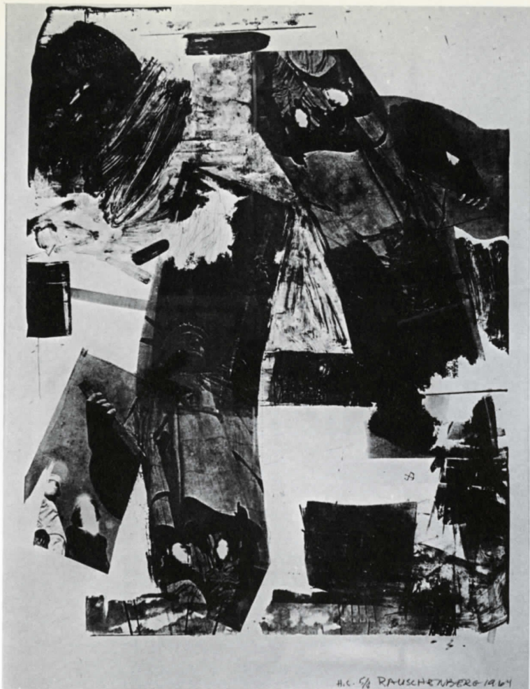
25. Front Roll, 1964 Lithograph 41¼" x 29" Printed on Rives BFK paper Edition: 39, plus 4 artist's proofs and 8 hors commerce Publisher: U.L.A.E. Printed from two stones in black and red