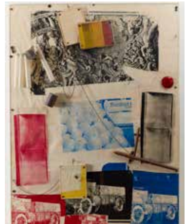
2. View of Robert Rauschenberg's Sleep for Yvonne Rainer (1965) showing an alternate arrangement of the movable elements.