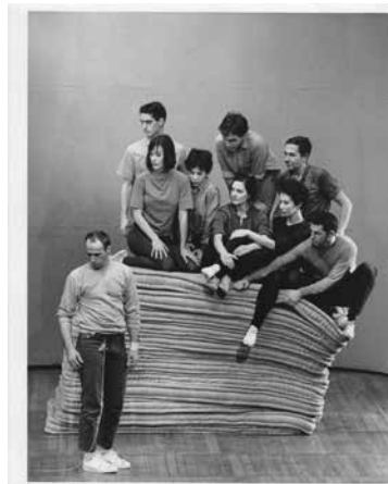
4. Production photo of Yvonne Rainer's Parts of Some Sextets, Wadsworth Atheneum, Hartford, CT, March 6, 1965. Pictured performers: Robert Morris, Lucinda Childs, Steve Paxton, Yvonne Rainer (front left on mattresses), Deborah Hay, Tony Holder, Sally Gross, Robert Rauschenberg (back right on mattresses), Judith Dunn, and Joseph Schlichter.