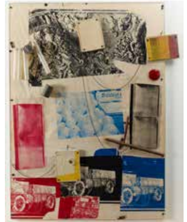
1. Robert Rauschenberg, Sleep for Yvonne Rainer , 1965; mixed media and paper collage with screenprint, 84 1/2 x 60 1/2 x 7 1/4 in. (214.63 x 153.67 x 18.42 cm); The Doris and Donald Fisher Collection at the San Francisco Museum of Modern Art; © Robert Rauschenberg Foundation / Licensed by VAGA, New York, NY; photo: Ian Reeves