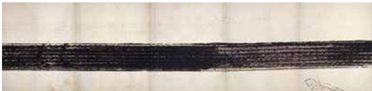
1. Robert Rauschenberg, Automobile Tire Print , 1953 (detail); paint on 20 sheets of paper mounted on fabric, 16 ½ x 264 ½ in. (41.91 x 671.83 cm); Collection SFMOMA, Purchase through a gift of Phyllis Wattis; © Robert Rauschenberg Foundation / Licensed by VAGA, New York, NY