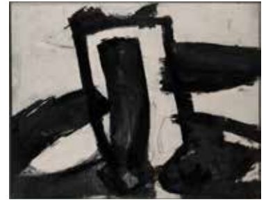
2. Franz Kline, Untitled , 1952. Enamel on canvas, 53 3/4 x 68 in. (135.6 x 172.7 cm). Metropolitan Museum of Art, New York, The Muriel Kallis Steinberg Newman Collection, gift of Muriel Kallis Newman, 2006; © The Franz Kline Estate / Artists Rights Society (ARS), New York

broad black-on-white brushstrokes of Kline (fig. 2). 6 In a gesture of acknowledgment-cum-subversion like that seen in Erased de Kooning Drawing , Rauschenberg's use of an automobile driven by a friend to make a rich, juicy black line holds to the abstract expressionist ideal of directly capturing spontaneous artistic expression while completely upending the aggrandized notions of authorship and the autographic mark celebrated in Newman's and Kline's paint strokes. 7 The deadpan transfer of a tire mark to paper removed his psyche and hand from the creative act and reset the terms for what it meant to be an artist in ways that correspond closely to Cage's strategies, a point to which we will return.