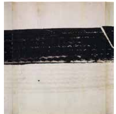
4. Detail of Robert Rauschenberg's Automobile Tire Print showing the unpainted imprint of a tire tread beneath the painted tire mark

8 With Cage being the more established presence in New York art circles, it follows that Rauschenberg—a slightly younger gay man working to define his own role in the same circles—would have used Cage's strategies as a jumping-off point for his own. Cage's silence, part of a distinctive form of ironic resistance, speaks directly to Automobile Tire Print . Just as Cage sought to decentralize the role of the composer and performer and