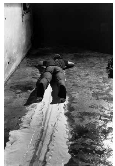
5. Paul McCarthy, Face Painting—Floor, White Line , 1972 (still). Video, black and white, 6:02 min. Courtesy the artist and Hauser & Wirth; © Paul McCarthy