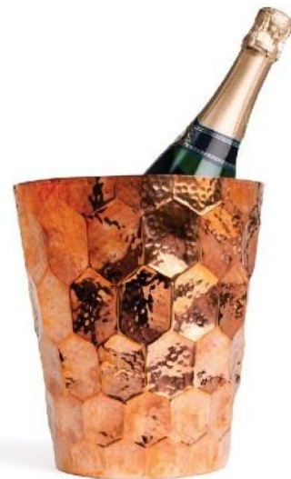
Hex Champagne Bucket, $235; Tom Dixon; solid copper

Adding flair to even the most fashionable of holiday affairs, the Hex Champagne Bucket ($235) is made from solid copper that is hammered into a hexagonal pattern and buffed to a high polish. Each individual champagne bucket develops a unique patina as the cooper oxidizes, making it a truly one-of-a-kind gift. Every party needs a little spice, especially those that take place in the kitchen. The Tower Salt and Pepper Grinders ($75 and $85) by Tom Dixon provide just that. SFMOMA's long-standing commitment to local designers and artisans continues with the Tina Frey Charcuterie Boards ($140) , available in white or gray. Designed and hand-sculpted by Tina Frey in San Francisco, these serving platters will be the belle of any ball.