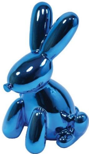
Balloon Bunny Bank: Blue, $40; ceramic with glossy finish