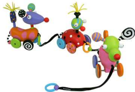
Zolo Pull Toy, $40 Available in three personalities: Scoot, Buggy, and Ozlo Wood Ages 2 and up

Another children's gift as practical as it is entertaining is the Little Miss Piggy Dynamo Flashlight ($18, ages 4 and up). The flashlight is in the shape of a little pig, the nostrils of which are fitted with two bright LED bulbs that recharge within a few seconds of squeezing. With no need for batteries or bulb replacements—ever—the flashlight is great for kids of all ages to keep on hand in the event of an emergency. The wooden Zolo pull toy ($40) is painted in bright colors and fun patterns and has