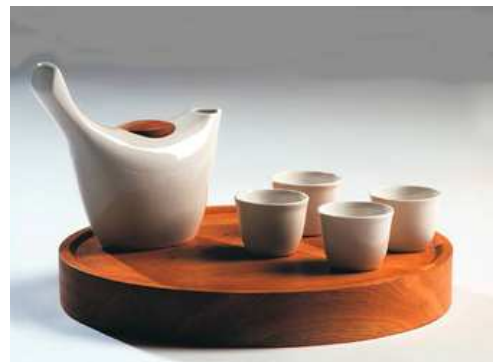
Kotori Sake Serving Set, $295 Designed by Tomi Pelkonen, JUJU Design Party of Finland Porcelain and oak

Incorporating new technology with age-old material, the TO:CA LED clock ($185) displays the time in LED light that emanates through a natural grain, hard-maple wood block. Designed by Kouji Iwasaki of Japan, the TO:CA clock is certain to please modern design enthusiasts on your list. Bestowing the gift of the Lumen pine tree oil lamp ($50) will surely cast the giver in the best light; placed on a shelf or mantle and lit with a match, the